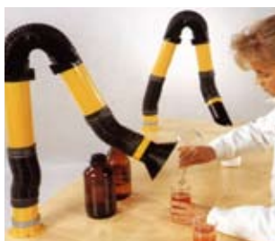
Figure 5 Moveable capturing hood