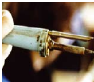
Figure 2 On-tool extraction – soldering iron

An LEV hood may be tiny and built into a hand-held tool or it may be large enough to walk into. Here are some examples.