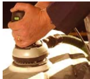
Figure 3 On-tool extraction – hand sander