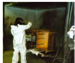
Figure 7 Walk-in booth