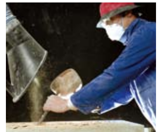
Figure 4 Fixed capturing hood